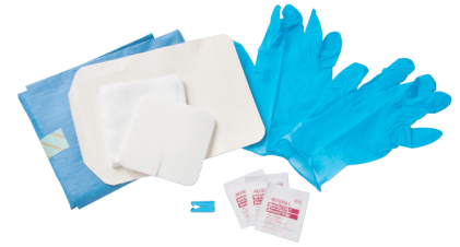
ASEPT® Procedure Pack