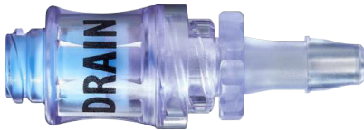
ASEPT® Replacement Valve