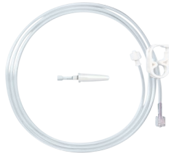
ASEPT® Drainage Line Set