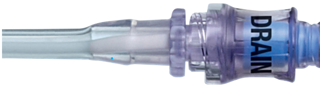
ASEPT® Permanent Drainage Catheter