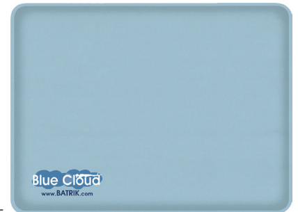
20" X 32"