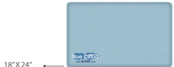
18" X 24"