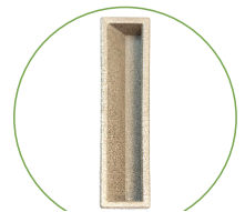
NEW! ANTIMICROBIAL HANDLE

HEPA filtered circulating air PATENT PENDING