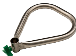
V-50006 STAINLESS STEEL TRIANGULAR HANDLE