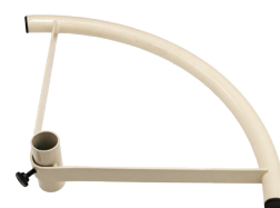
V-50007 CREAM SEMI-ROUND HANDLE