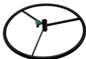
V-50003 BLACK STEEL ROUND HANDLE