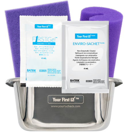
Part number #17-177 or 17-277

Enviro-Sachet™ offers a smarter solution for today's global healthcare supply chain.