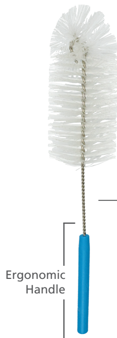
REUSABLE JAR/BOTTLE BRUSH