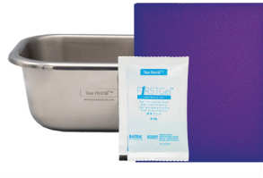
ENVIRO-SACHET™ NON-ENZYMATIC CLEANER