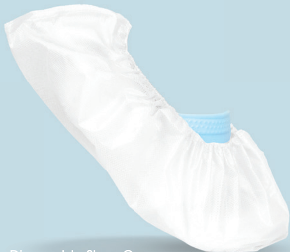
Disposable Shoe Covers Coated Line™