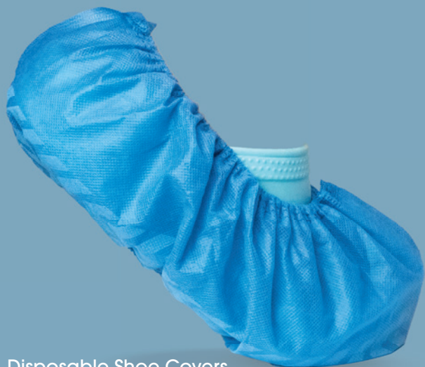
Disposable Shoe Covers Soft Line™