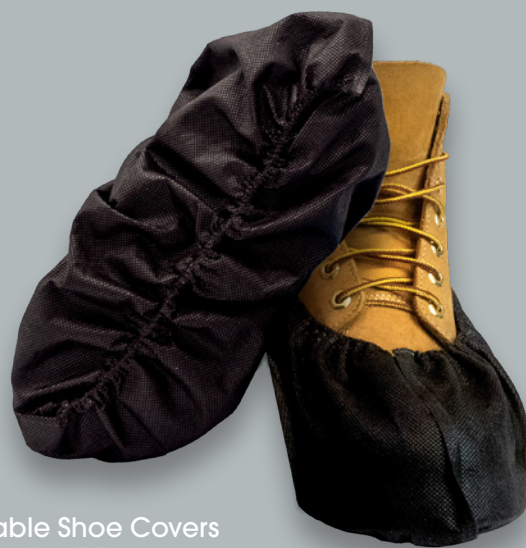
Disposable Shoe Covers Tough Line™