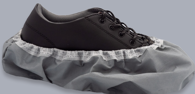
Grippez Shooz™ Disposable Shoe Covers Rhino Grey