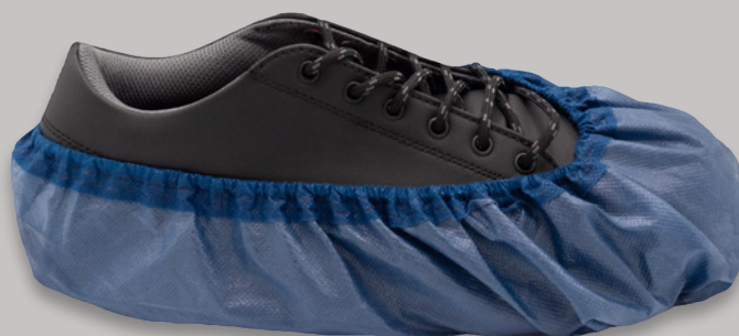
Grippez Shooz™ Disposable Shoe Covers Gecko Navy